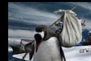
graphic design (© Rodrigo Unda)