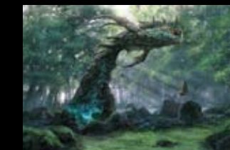
illustration (© Hong Kuang)