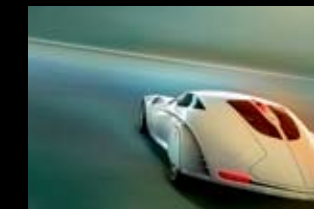
industrial design