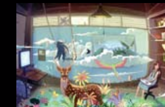
manga/comics (© VOFAN)