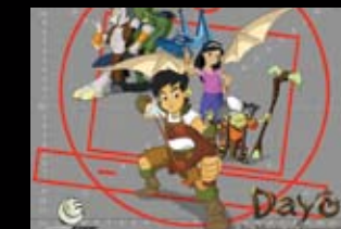
CG animation